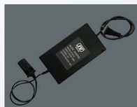
Powering with the AC Power Supply (JY11012)(Optional Accessory Page34)