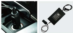
Powering with the AC Power Supply (JY11012) (Optional Accessory Page34)