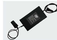
Powering with the AC Power Supply (JY11012)(Optional Accessory Page34)